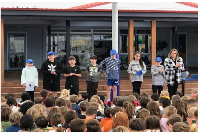
Congratulations to the latest Blue Caps. You have all worked super hard for this.